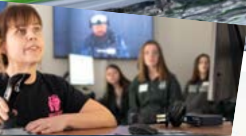
Integrated Emergency Services Complex (IESC)