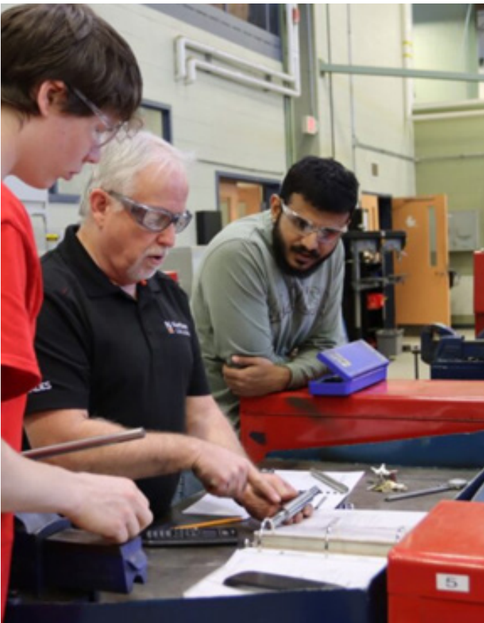
Venture Northern College: Student Innovation Challenge 2026

In recognition of this vital support, your logo will be prominently displayed on all event marketing materials, digital promotions, and on-site signage. You will also have the honour of awarding the cheque to the first-place winning team live on stage during the final pitch event, highlighting your organization's leadership in supporting innovation, youth development, and regional growth.